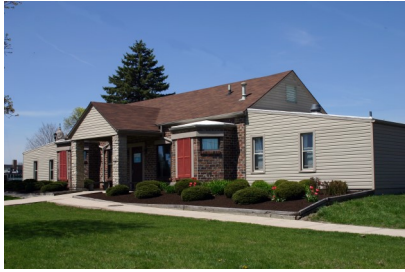
William Maier Senior Citizens Center

The Operation Recreation 2020 Levy Committee is a volunteer group of dedicated Troy stakeholders. It is not a City-led effort but the City obviously has a vested interest in improving these facilities and completing these projects.